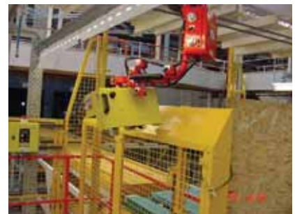
Professional Custom Designed Systems