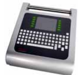
3000 series controller