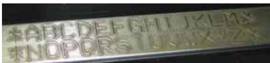
Marktronic™ InScribe™ 140-40SDPH Mark

The SP range uses a diamond or carbide tip and is ideally suited to marking small to medium characters. The SDPH (Scribing - Deep Pneumatic - Heavy Duty) range features a powerful carbide tip actuator with a robust high torque motor driven X-Y mechanism. Originally developed for VIN marking applications, the 140-40SDPH model is perfect for high speed, deep marking applications.